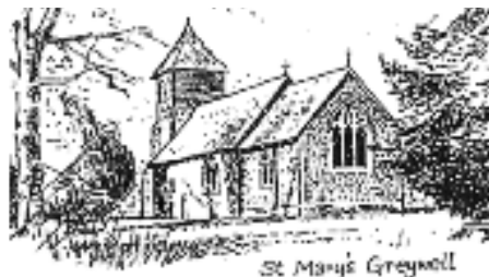
St Mary's Greywell